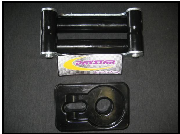
Daystar also makes a cable & hook isolator to further protect your investment.