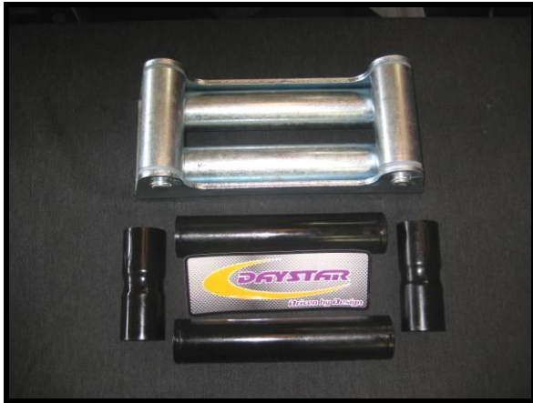
The Daystar Kit comes with 2 vertical & 2 horizontal replacement rollers.

Daystar products saw this issue and came up with an inexpensive, easy to install fix, the "Poly Winch Roller". The roller kit comes with everything needed to replace the factory steel rollers in a roller fairlead with premium polyurethane units that hold allow the rope to roll across the surface as well as operate at more severe angles. Daystar also makes a slick poly cable & hook isolator (shown in last photo) that protects the poly rollers from damage. So, follow along as we install a set on a standard roller fairlead.