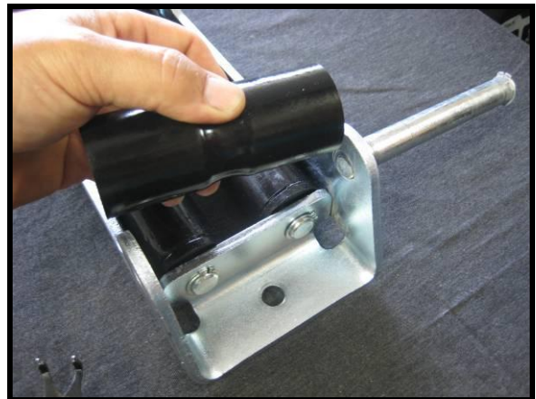
Install the Daystar Rollers with the factory shafts and retaining clips.